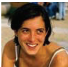
Friday, August 8 Luncheon, Ticketed Event

The award-winning author has been a guest on dozens of national and local television shows, including educational programs for the History Channel, Learning Channel, and Discovery Channel.