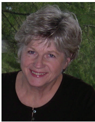
Thursday, August 7 11:00 am to 2:00 pm